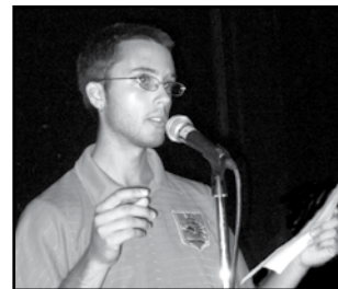
A counselor at the Overnight Leadership Camp sings at the daily Vespers.

At the 2009 Overnight Leadership Camp, this pledge was made by the oldest campers. We believe it reflects a profound connection that participants in our Youth Empowerment Program feel for each other and the importance of our programs in their lives.