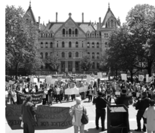
The tremendous crowd gathered on Farmworker Albany Day - farmworkers, members of communities of faith, labor unions, NY State legislators, and social justice advocates.

Current Covenanting Denominations include: American Baptists of New York State through the leadership of the Mid-Hudson and Capital Area Baptist Associations, the Episcopal Dioceses of New York and Rochester, New York Yearly Meeting of the Religious Society of Friends (Quakers), The New York Conference of the United Church of Christ (UCC), The New York Annual Conference of the United Methodist Church, The New York Synod of the Reformed Church of America through the leadership of the Mid-Hudson and Orange Classes, The Presbyteries of Albany and the Hudson River, the Roman Catholic Dioceses of Albany and Rochester.