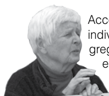
A demonstrator for farmworker rights in Albany.

The main purpose of Rural & Migrant Ministry's Accompaniment Program is to strengthen a rural network across New York that empowers farmworkers and other rural workers to more effectively change an agricultural system that has historically oppressed them.