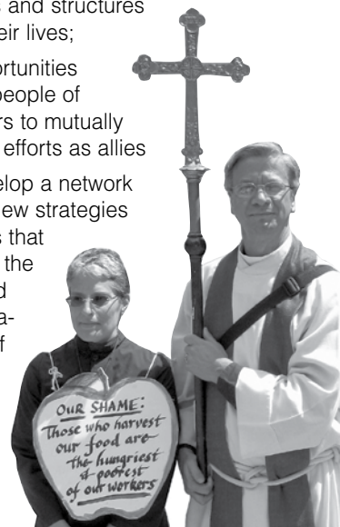
Bearing witness at Farmworker Albany Day in May.

• In turn, to develop a network and creative new strategies and structures that can withstand the increasing and powerful, negative reaction of agri-business as well as the anti-immigrant waves sweeping the country