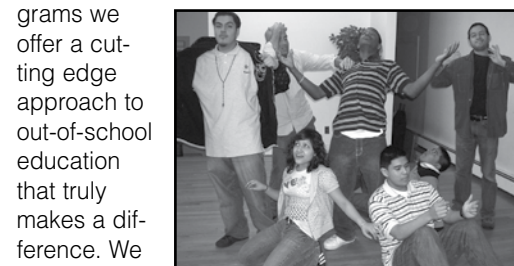
Youth Arts Group members learning improv as a tool for social justice presentations

The history of Rural & Migrant Ministry began in responding to these barriers as we created a Head Start Center in 1985. Today we offer an innovative array of youth empowerment programs that span upstate New York. Through our programs we offer a cutting edge approach to out-of-school education that truly makes a difference. We are pleased that over 90% of the graduates of our