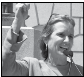
Kerry Kennedy, founder of the Robert F. Kennedy Memorial Center for Human Rights, speaking at Farmworkers Albany Day 2009.

Farmworkers Campaign (JFW). JFW is a broad coalition of labor unions, faith communities and student organizations committed to ensuring that the voice of farmworkers in New York is heard in the public policy process. Of specific concern is a legislative campaign that would remove those sections of New York's labor laws that exclude farmworkers from equal rights.